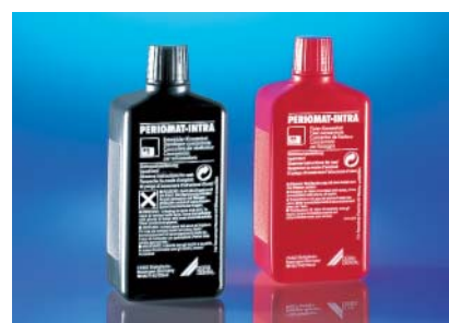
The new Dürr Periomat Intra-chemistry, developer and fixer exactly suited modern processor performance

DÜRR DENTAL AG Höfigheimer Strasse 17 74321 Bietigheim-Bissingen Germany