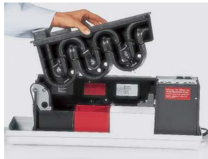
With only one movement, the transportation-system can be taken out

For a radiographic developer it is unbelievably easy to use. It only requires electricity and chemicals, and development can start right away. Nothing else is necessary in order to then develop perfect X-ray pictures.