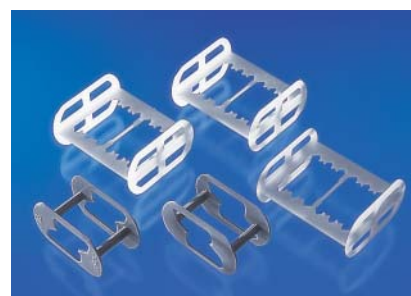
With the adaptor the developing of all intra-oral pictures is possible