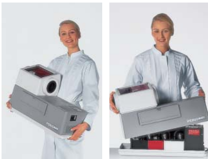
The Dürr Periomat plus simply supports work in the practice

For a radiographic developer it is unbelievably easy to use. It only requires electricity and chemicals, and development can start right away. Nothing else is necessary in order to then develop perfect X-ray pictures.