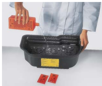
Thorough cleaning of the film transport with the Perioclean set